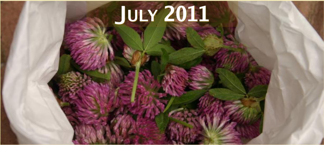
Trifolium pratense , red clover