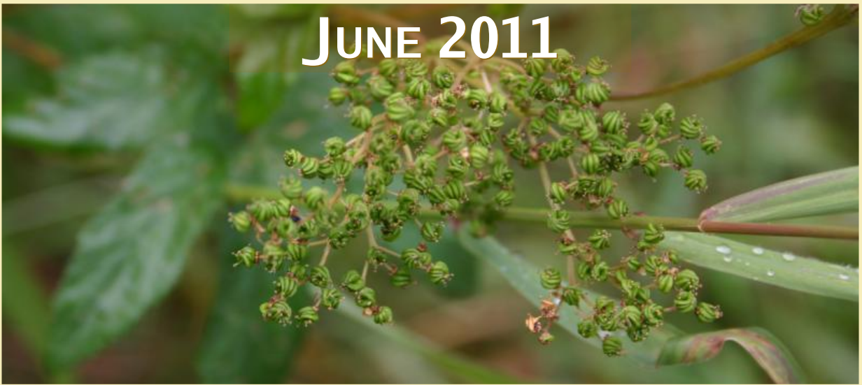
Filipendula ulmaria , meadowsweet