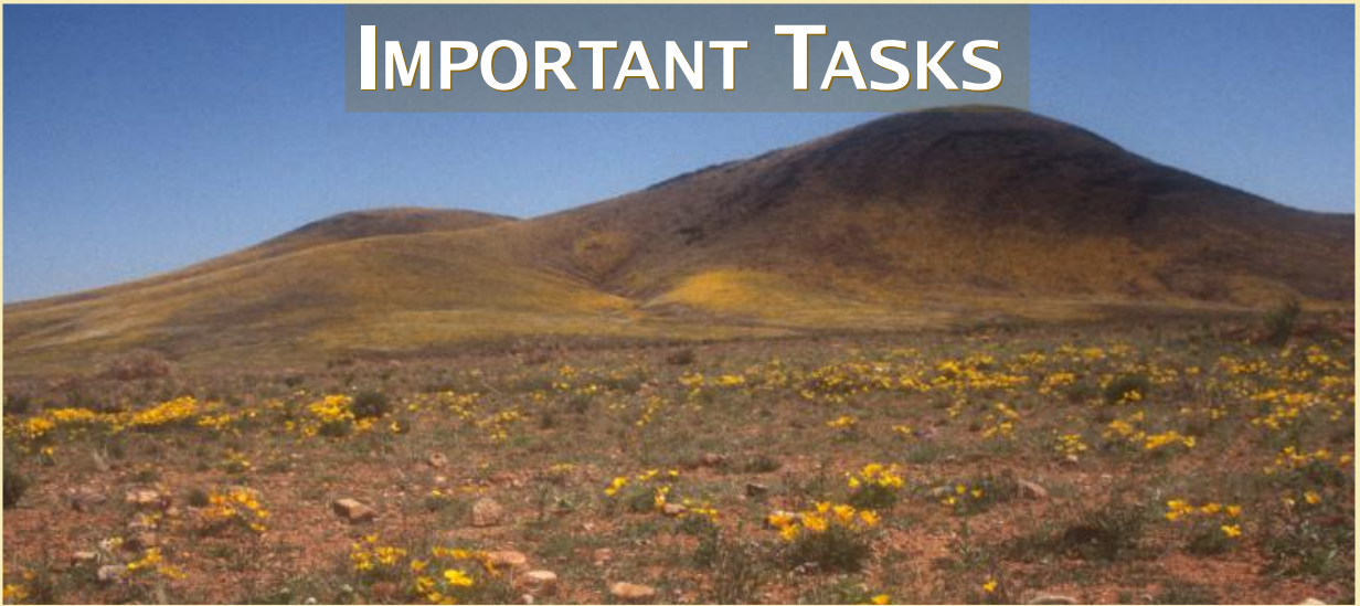
Eschscholzia californica , California poppy