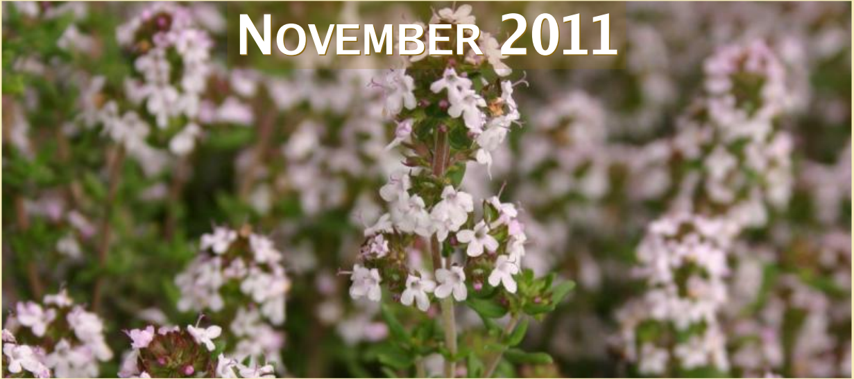
Thymus vulgaris , thyme