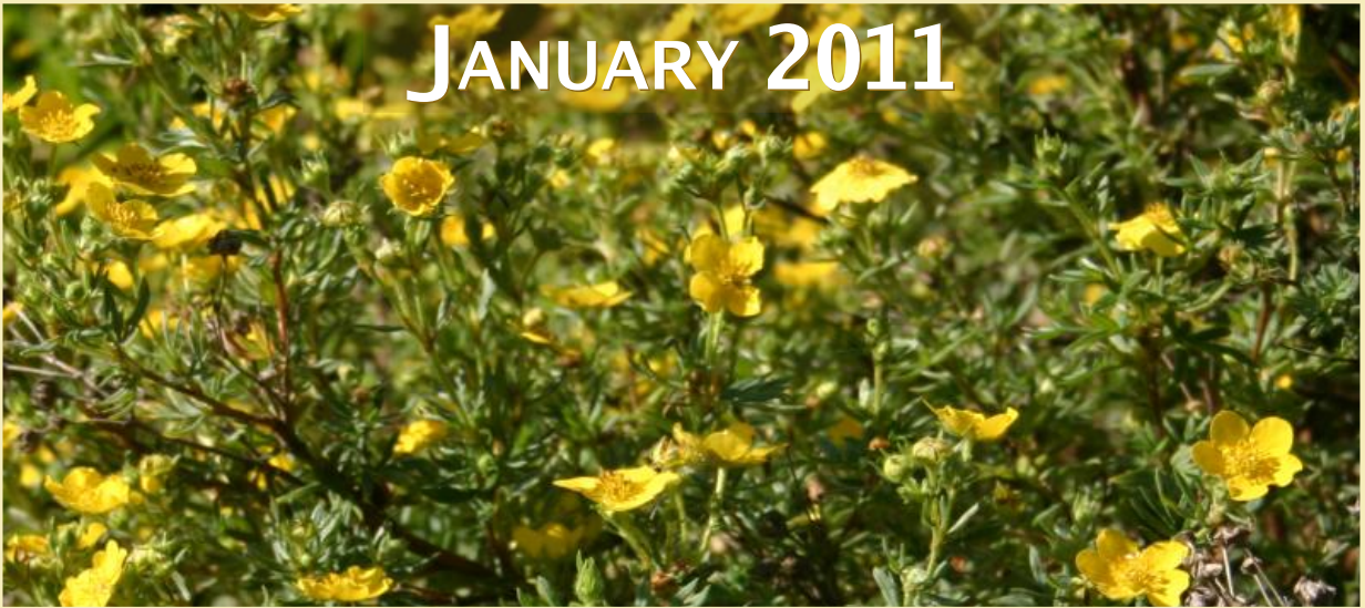
Potentilla fruticosa , bush cinquefoil