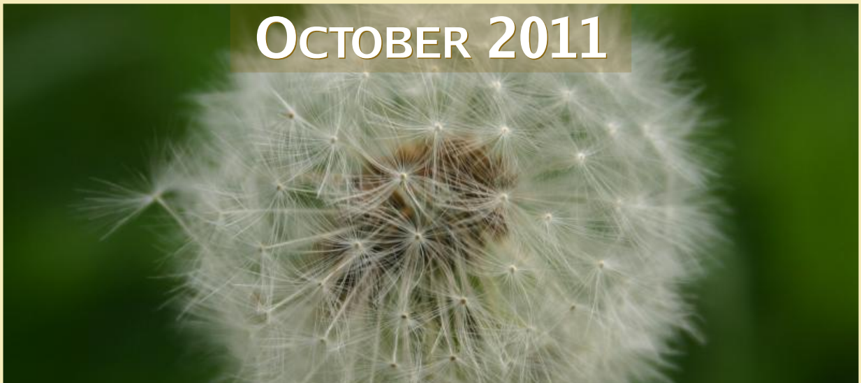
Taraxacum officinale , dandelion