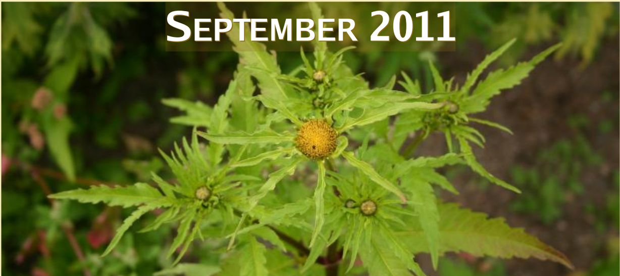
Bidens radiata , greater bur-marigold