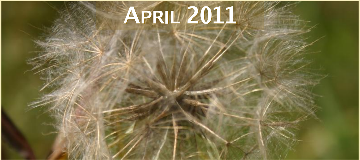
Tragopogon pratensis , goat's beard