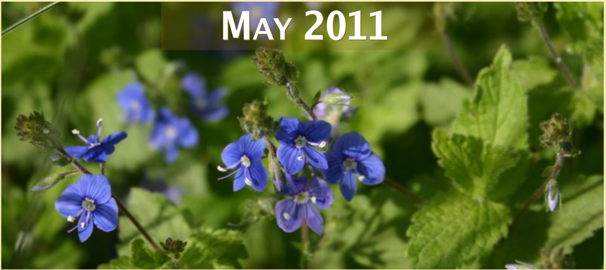
Veronica chamaedrys , germander speedwell