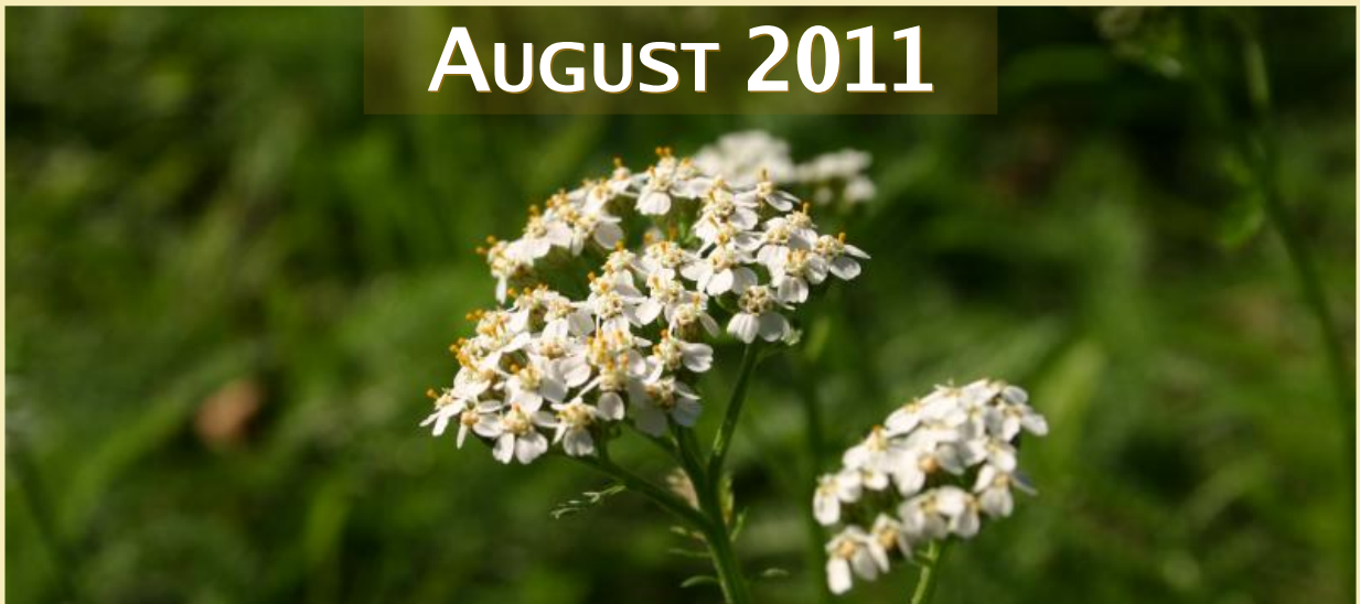
Achillea millefolium , yarrow