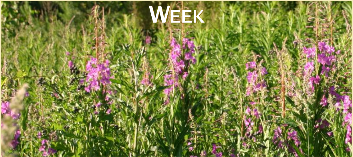
Epilobium angustifolium , fireweed, great willowherb